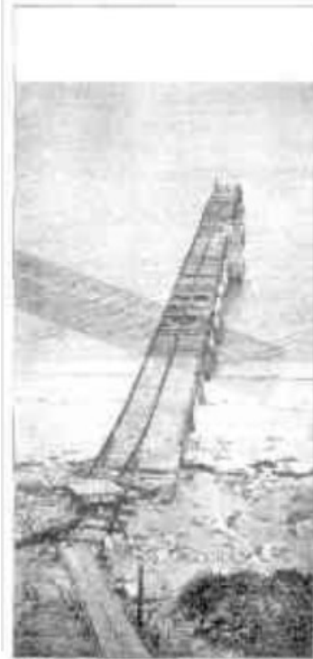
Printed in The Adelaide Chronicle Saturday 17th June 1915

Caption: The pier at Port Moorowie damaged after the storm.