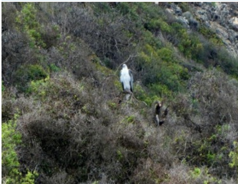
White-bellied Sea-Eagle ( Haliaeetus leucogaster ). taken in the vicinity of Kemp Bay.