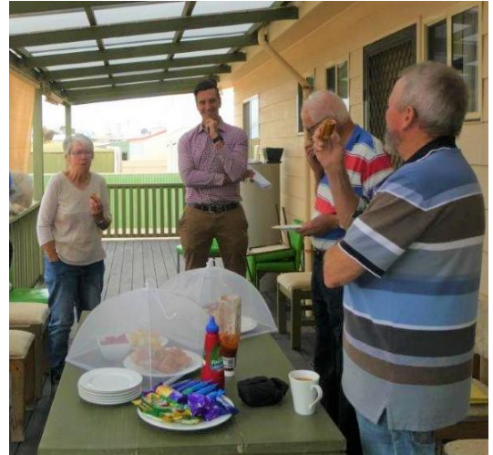
Morning tea with some of the Committee

We thank him for his contribution and for the opportunity to provide robust feedback to him.