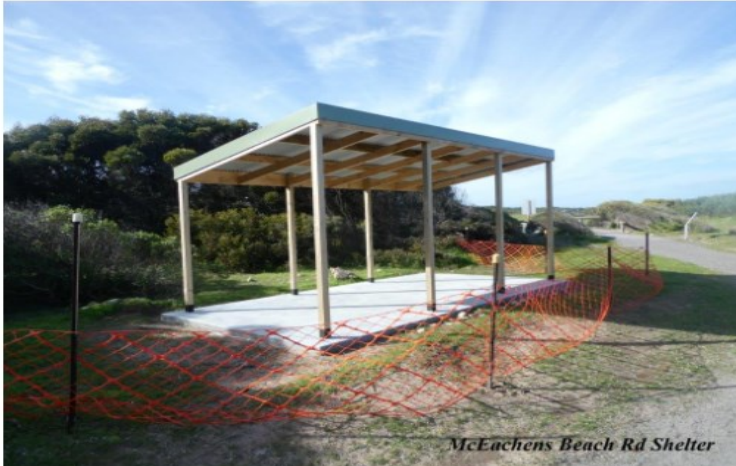
McEacherns Beach Rd Shelter