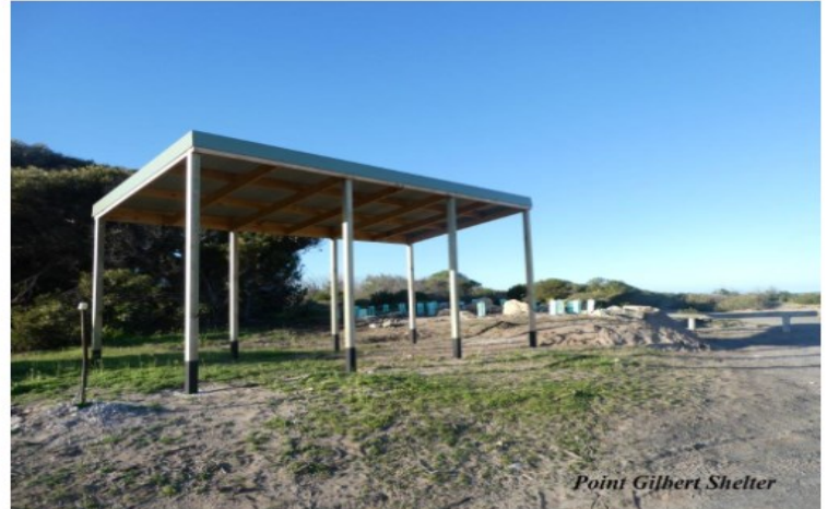
Point Gilbert Shelter