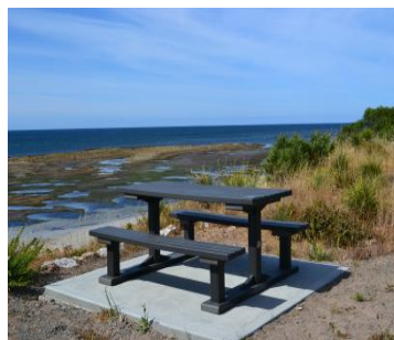
Outback Table Setting