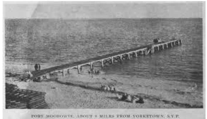
Port Moorowie Jetty – photo taken pre 1921 and reproduced in a booklet '100 Views of Southern Yorke Peninsula' by R Wilkinson c1921

The jetty was damaged during a storm in 1915 (bottom picture), but was repaired by the Government. It was then washed away in a storm in 1953 but was later burnt whilst being dismantled and, unfortunately, has never been replaced. WHAT A SHAME!!!!