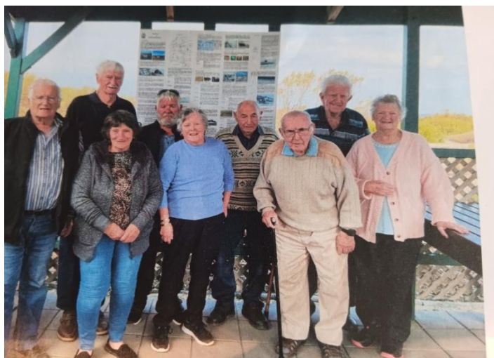
Printed with permission

We do hope that other groups will also visit our township and take advantage of the facilities whilst also learning more about the history of our township.