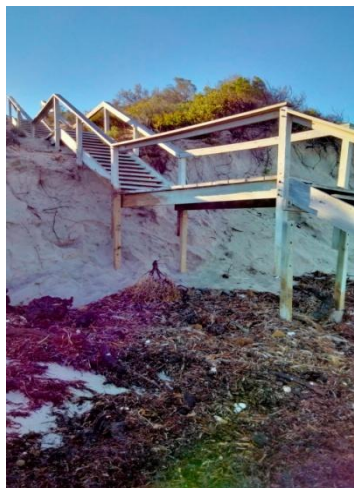
Mozzie Flat steps